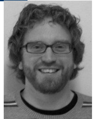
Your friendly neighbourhood community developer